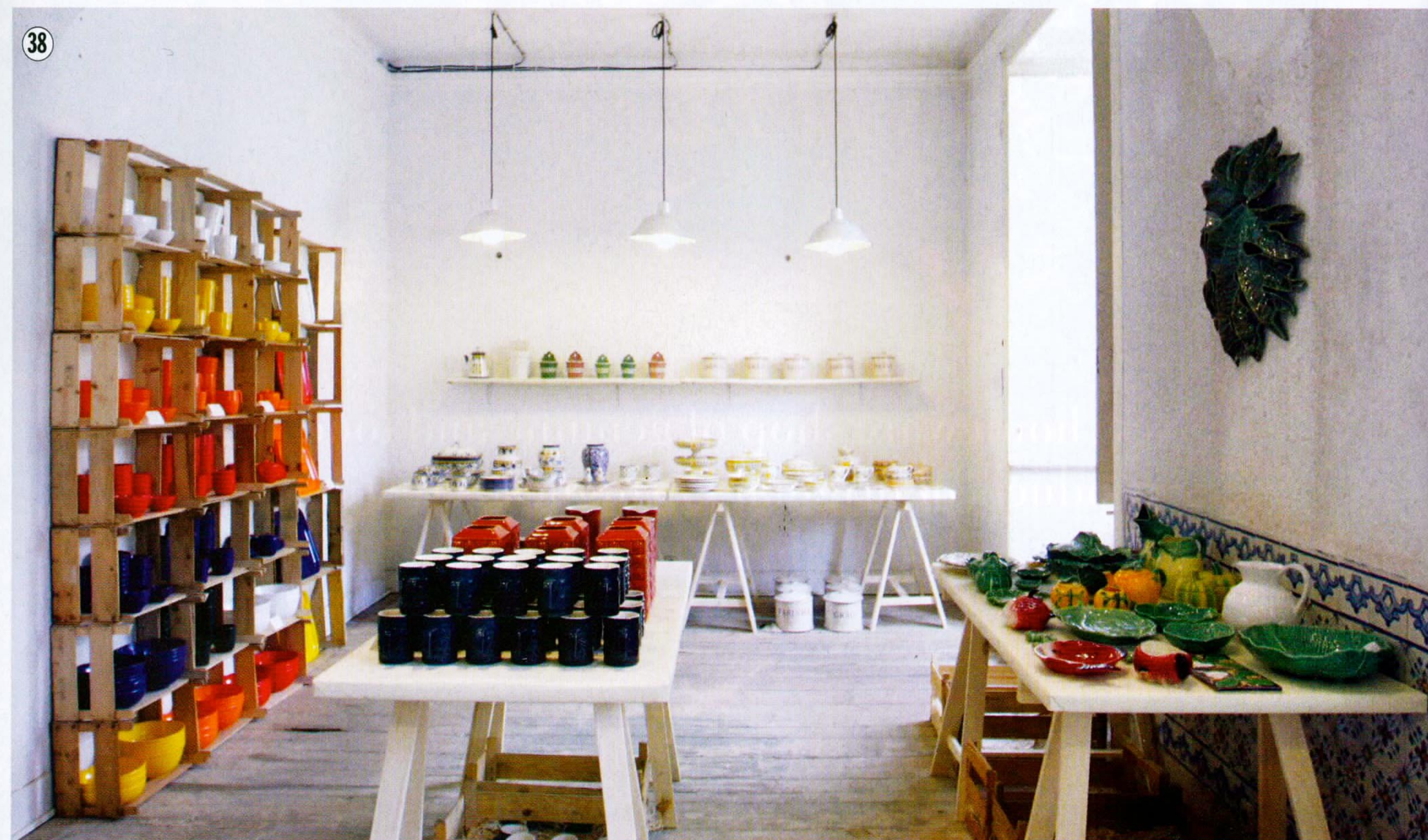
30 Time Out Lisbon

The portion that spans the Alcântara valley contains the world's tallest ogival (pointed) arch – at 65.29 metres high and 28.86 metres wide – but that is not the only amazing thing about it. The Aqueduto das Águas Livres was built in the 18th century to supply the city with water at a time when it was growing fast, and survived the 1755 Earthquake. Of the 58,135 metres that comprise its length, 941 may be visited between March and November, from an entrance in Campolide, a short walk from the Amoreiras mall. The tour offers a unique perspective over the city and a series of curiosities, such as the story of 19th-century murderer Diogo Alves, who used to jump out